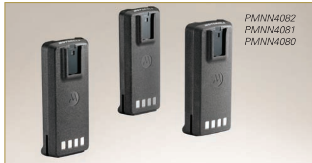
PMNN4082 PMNN4081 PMNN4080

Heliflex antennas are engineered for maximum output and coverage. Stubby antennas are unobtrusive, ideal for wearing the radio on a belt. Whip antennas are one-piece with a steel core for optimal radiation.