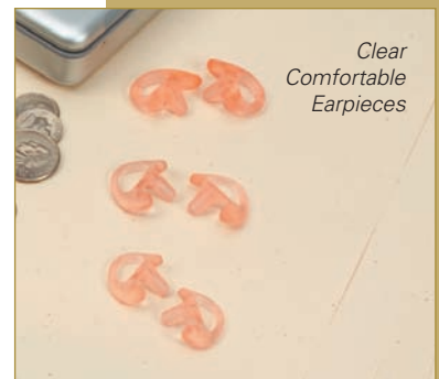
Clear Comfortable Earpieces