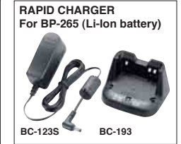
RAPID CHARGER For BP-265 (LI-Ion battery)