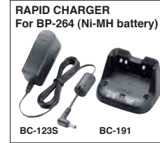
RAPID CHARGER For BP-264 (NI-MH battery)