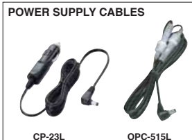
POWER SUPPLY CABLES