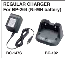
REGULAR CHARGER For BP-264 (NI-MH battery)

*Tx: Rx: standby = 5:5:90. Power save function ON.